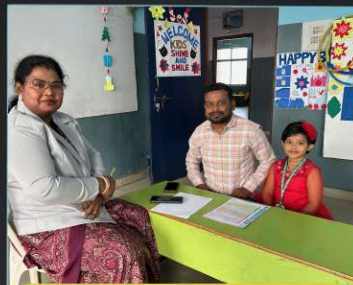
PARENTS TEACHERS MEETING