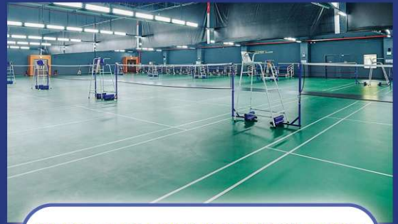
INDOOR & OUTDOOR BADMINTON COURT