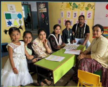
PARENTS TEACHERS MEETING