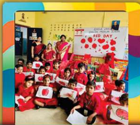
Math & Counting Skills

"Education is the best gift that we can give to our Children"