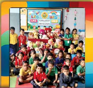
Social & Emotional Learning

Cognitive development in early childhood means how children think, explore and figure things out. It is the development of knowledge, skills, problem solving and dispositions, which help children to think about and understand the world around them. Brain development is part of cognitive development.