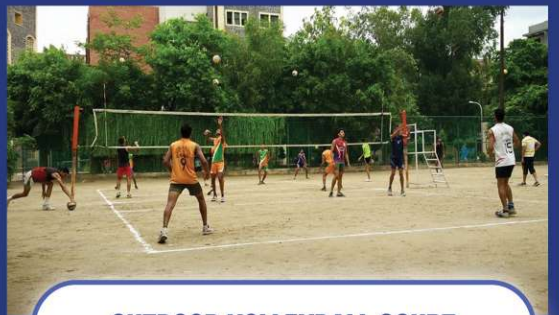
OUTDOOR VOLLEYBALL COURT