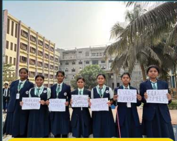
MATHS DAY ACTIVITY