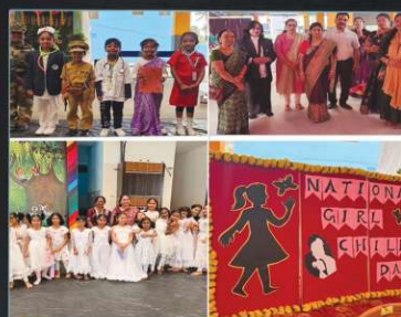
GIRL CHILD DAY