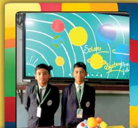
Language & Communication Skills

From understanding basic counting to practicing simple addition and subtraction, kindergarteners will need to master basic math skills that will set them up for success in school. Since kindergarten mainly focuses on numbers, shapes, and patterns, it's beneficial to familiarize your child with these basic concepts.