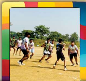
Movement & Physical Skills

SEL has five main skills: self-awareness, social awareness, responsible decision-making, self-management, and relationship skills. Specific topics that schools often teach include identifying feelings, considering other people's perspectives, and brainstorming solutions to problems.