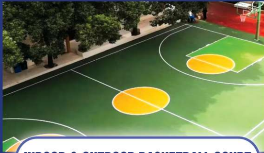
INDOOR & OUTDOOR BASKETBALL COURT

This arena doesn't just shape players — it shapes champions. Here, passion drives every move, grit powers every challenge, and every game becomes a step toward greatness.