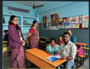
PARENTS TEACHERS MEETING