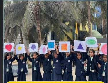
MATHS DAY ACTIVITY