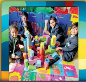
Cognitive Skill Development

During early childhood, children's ability to understand language at a more complicated level also develops. Young children develop "Illocutionary Intent", or the ability to understand that a sentence may have meaning beyond the exact words being spoken.