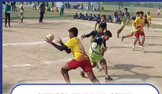
OUTDOOR HANDBALL COURT